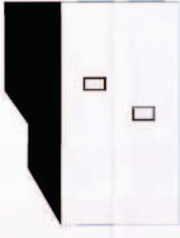
3 West Elevation