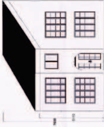
1 Front Elevation