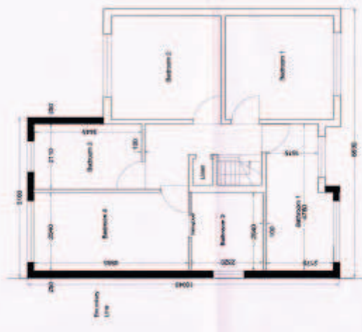
5 First Floor Plan